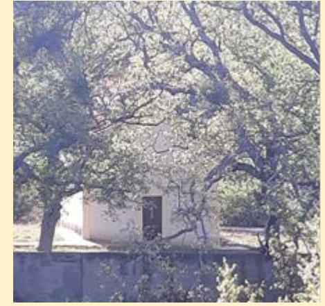
The Chapel is situated under walnuts and chestnuts. On the left the Holy Icon

On Easter Friday, on May 7 at the feast of Zoodochos Pigi, many village residents visited the Virgin Mary Chapel (Theotokos) at the border with Varvitsa village to attend the liturgy.